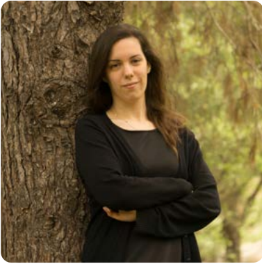
Project Manager at the Modern Agriculture Foundation