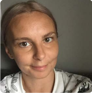
Night shift Assistant for Tesco