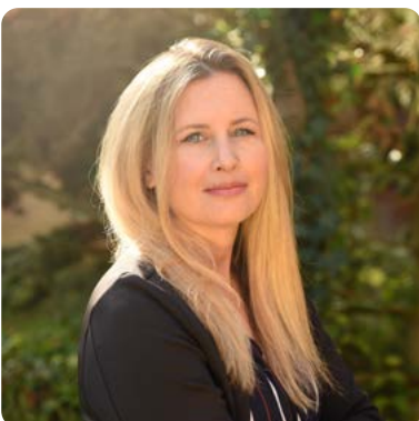
Global Senior Campaigns Manager at CIWF