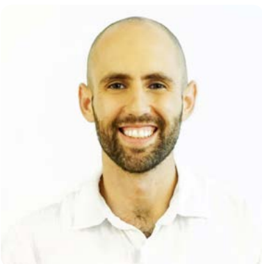
Head of Operations at 50by40